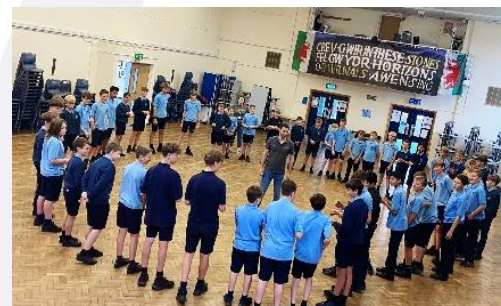
Only Boys Aloud Song Workshop