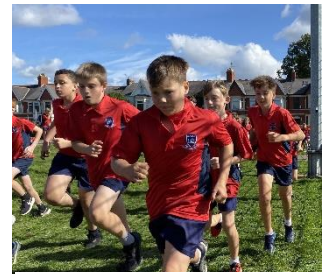
Cross Country 2023

We've enjoyed a busy fortnight, with students settling down well to school life. It was also good to see the tremendous levels of participation in our annual Cross Country race this week and the enjoyment and energy of all those who participated. Sincerely also, may we thank you for your support in ensuring high standards of school uniform and truly positive response to our request for improved punctuality, diolch yn fawr to you all!